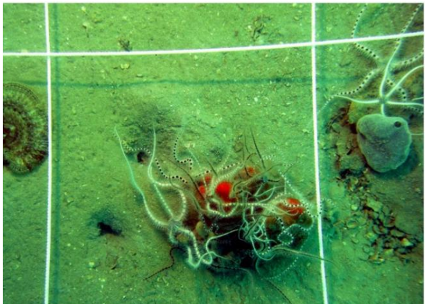
Mediterranean soft bottoms