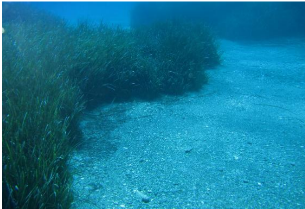
Mediterranean seagrass ecosystems

We study modern marine environments and their young fossil record. We combine methods from ecology and paleontology to define community baselines needed for differentiating anthropogenic impacts from natural variability. Our aim is to set realistic targets for the restoration of disturbed ecosystems.